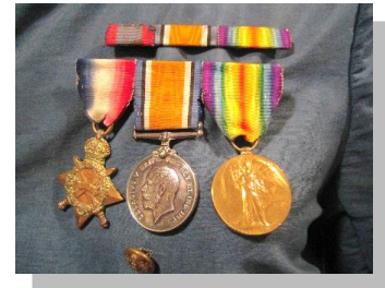
SAMPLE OF MEDALS

There is a section of Fonds containing stories, artifacts and pictures of graduates. Along with this is a book titled Bio-Book and this will be a complete history of the School of Nursing graduates, hospital 'firsts' and any outstanding event which occurred in a particular year, with pictures and quotes from the nurses. There is also an extensive collection of original paintings which were donated to the hospital and school, photo albums, scrap books, certificates, diplomas and class books. The artifacts range from the early microscope, instruments, equipment and machines to 1995.