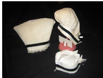
1800's, 1906, 1931 to 1980's