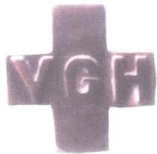
1892 – 1931