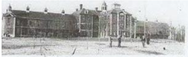
VGH – 1890 to 1948 when a new hospital was built