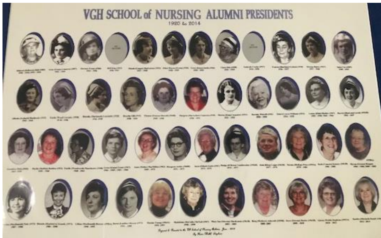
VGH SCHOOL of NURSING ALUMNI PRESIDENTS -1920 - 2014