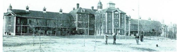
VGH – 1890 to 1948 when a new hospital was built