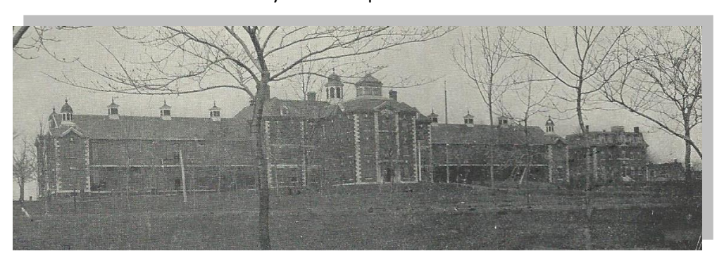
VICTORIA GENERAL HOSPITAL 1917

The VG Hospital physicians and nurses played a crucial role in helping the victims of the Halifax Explosion, Dec.6, at 9am. The resources at the hospital were taxed to the limit. The effects of this explosion raised National awareness need for medical, safety and public preparedness and disaster planning.